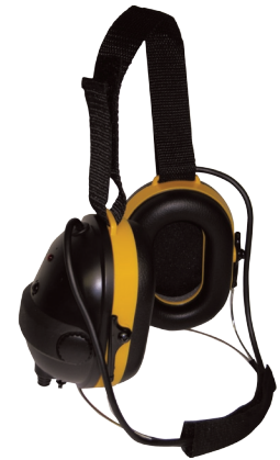
Model PA4100 - Behind-The-Head

A new innovation in safety protection, the NoiseBuster® Active Noise Reduction Safety Earmuff combines superior passive hearing protection with the most advanced active noise reduction (ANR) technology. The NoiseBuster ANR Safety Earmuff is specifically designed for the industrial worker. It is also an excellent choice for do-it-yourself users of lawn mowers and power tools, as well as for motor sports fans when used in conjunction with scanners. You can even listen to your portable audio player while wearing your NoiseBuster ANR Safety Earmuff. The product has a passive Noise Reduction Rating (NRR) of 26dB (depending upon the model). Additionally the NoiseBuster delivers up to 20dB of ANR in the low frequency range. Get the highest-performing hearing protector available — at an unbelievably low price!