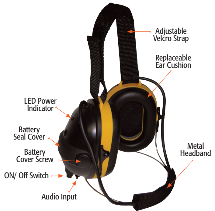
Model PA4100 - Behind-The-Head