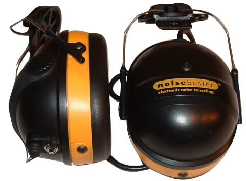
Model PA4200 - Hard Hat Cap Mount

A new innovation in safety protection, the NoiseBuster ® Active Noise Reduction Safety Earmuff combines superior passive hearing protection with the most advanced active noise reduction (ANR) technology. The NoiseBuster ANR Safety Earmuff is specifically designed for the industrial worker. It is also an excellent choice for do-it-yourself users of lawn mowers and power tools, as well as for motor sports fans when used in conjunction with scanners. You can even listen to your portable audio player while wearing your NoiseBuster ANR Safety Earmuff. The product has a passive Noise Reduction Rating (NRR) of 26dB (depending upon the model). Additionally the NoiseBuster delivers up to 20dB of ANR in the low frequency range. Get the highest-performing hearing protector available — at an unbelievably low price!