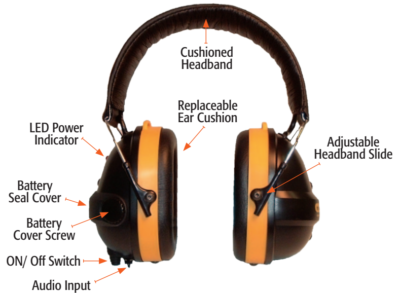
Model PA4000 - Over-The-Head