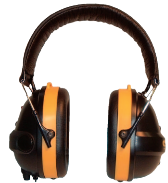
Model PA4000 - Over-The-Head

A new innovation in safety protection, the NoiseBuster ® Active Noise Reduction Safety Earmuff combines superior passive hearing protection with the most advanced active noise reduction (ANR) technology. The NoiseBuster ANR Safety Earmuff is specifically designed for the industrial worker. It is also an excellent choice for do-it-yourself users of lawn mowers and power tools, as well as for motor sports fans when used in conjunction with scanners. You can even listen to your portable audio player while wearing your NoiseBuster ANR Safety Earmuff. The product has a passive Noise Reduction Rating (NRR) of 26dB (depending upon the model). Additionally the NoiseBuster delivers up to 20dB of ANR in the low frequency range. Get the highest-performing hearing protector available — at an unbelievably low price!